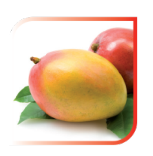
MANGO butter Antioxidant, Emollient.