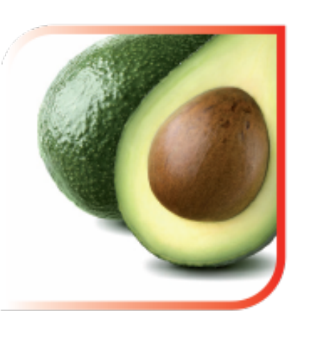
AVOCADO oil: Moisturizing, Lenitive.