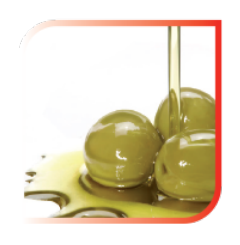
OLIVE oil: Reviving, Reinforcing.