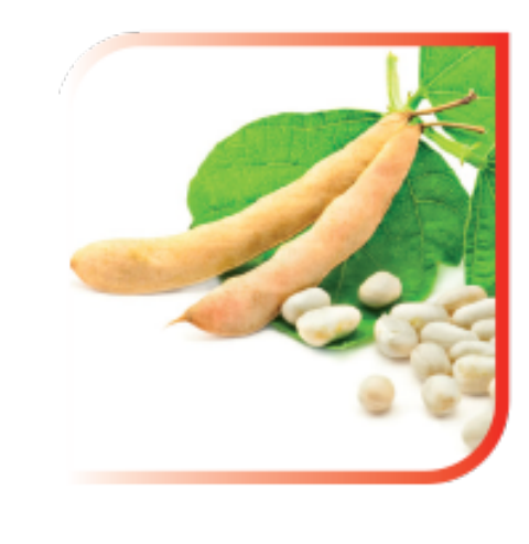
SOYBEAN oil: Nourishing and Skin Protective.